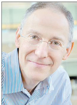
Ezekiel Emanuel